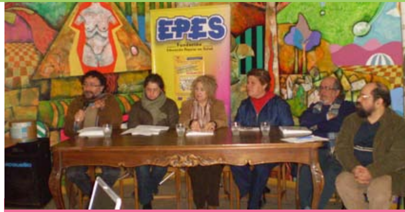
Panel presentation at the EPES School for Community Health Leaders. From left to right: Medical Director of Health Service Talcahuano, trained community leaders from the Council of Social Services, and the director of EPES Concepción.