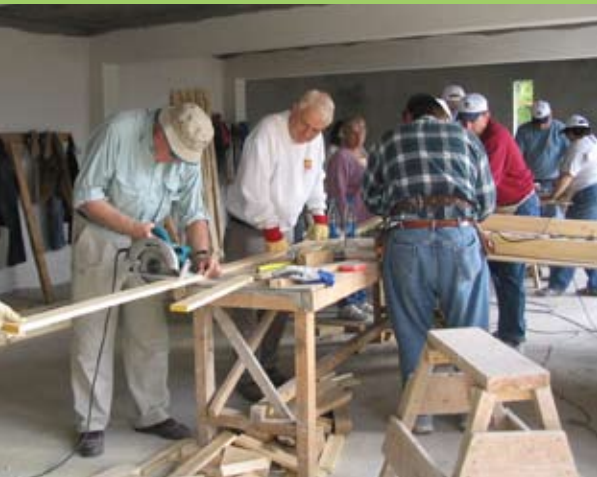
Volunteer work brigades from several U.S. congregations have participated in building projects at the EPES Center.