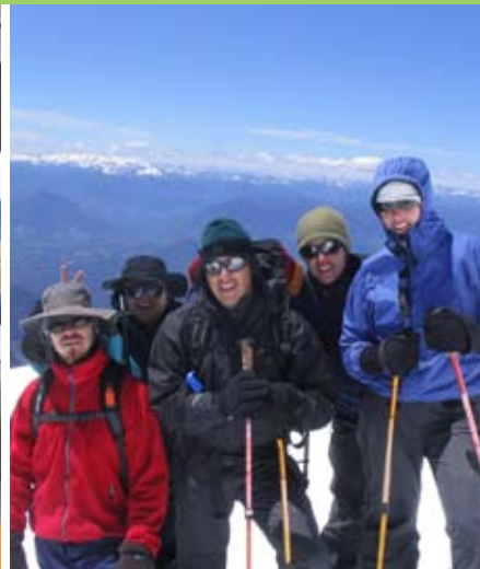
Climbers raise money for the EPES Center in Concepción by climbing Mt. Aconcagua.

The work of EPES commands enormous respect among the people it serves, their organizations, the community at large, and public health services. EPES was born as a project of the Iglesia Evangélica Luterana en Chile, but it no longer belongs solely to the Church. EPES belongs wherever men and women need the tools to claim their rights, organize for dignity, and achieve the full and abundant life that Jesus proclaimed.